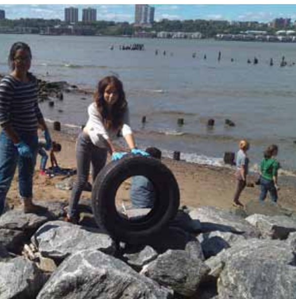
For International Coastal Cleanup Day, over 250 volunteers remove everything from tires to shopping carts from the Hudson River coast.

Regular volunteers also assist the Conservancy in responding to park emergencies. In 2011, volunteers were on hand to help after Hurricane Irene. Riverside Park's trees were devastated. Physical damage caused by falling trees and limbs was extensive. Hurricane Irene was the fourth destructive storm to hit the park in three years time.