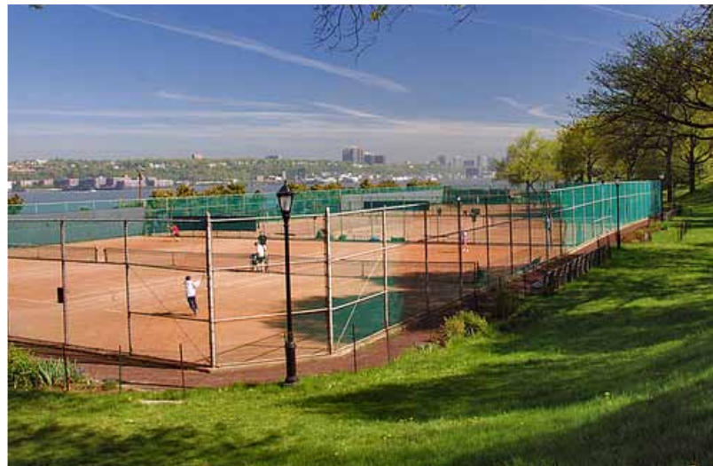
Young tennis enthusiasts help maintain the clay courts at 96th Street after participating in an RCTA program.