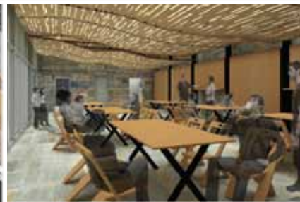
The 102nd Street Field House is undergoing a massive restoration for restrooms and programming space.