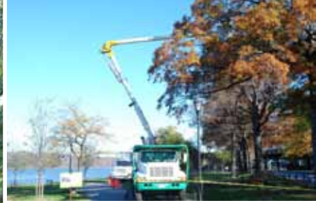
Constant pruning and repairing storm damaged trees are vital to the health and safety of Riverside Park.