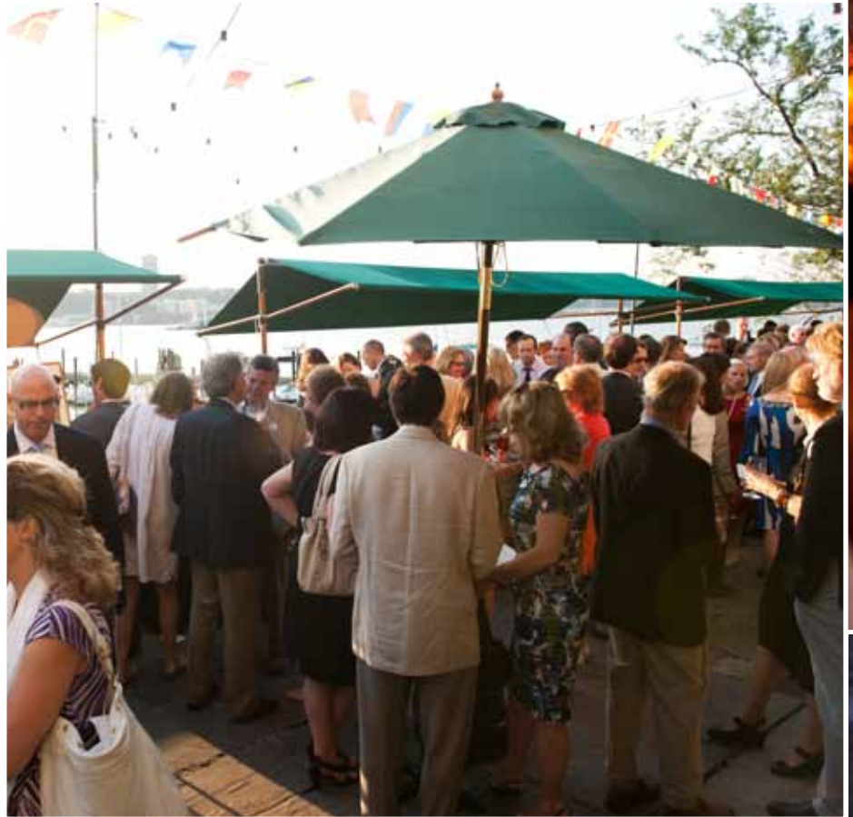
The annual June fundraising gala at O'Neals' West 79th Street Boat Basin Café draws long-time supporters and new members from the community.