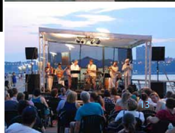
Summer on the Hudson programming includes yoga, movie nights, and concerts.