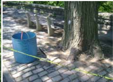
Annual inoculations are essential to stave off the aggressive blight of Dutch elm disease.