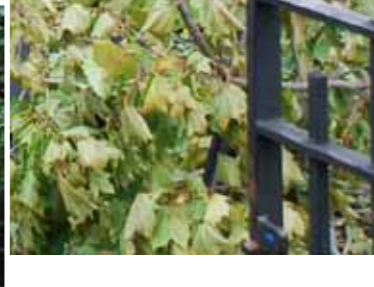
The Conservancy's operating budget includes $25,000 for tree care each year. For the past several years, destructive storms have hit Riverside Park and compromised its majestic trees.