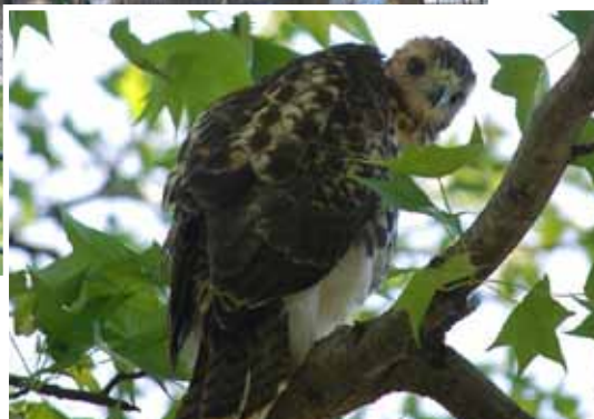
One of our many hawks and a shy raccoon are a sample of the wildlife to be found in the park.