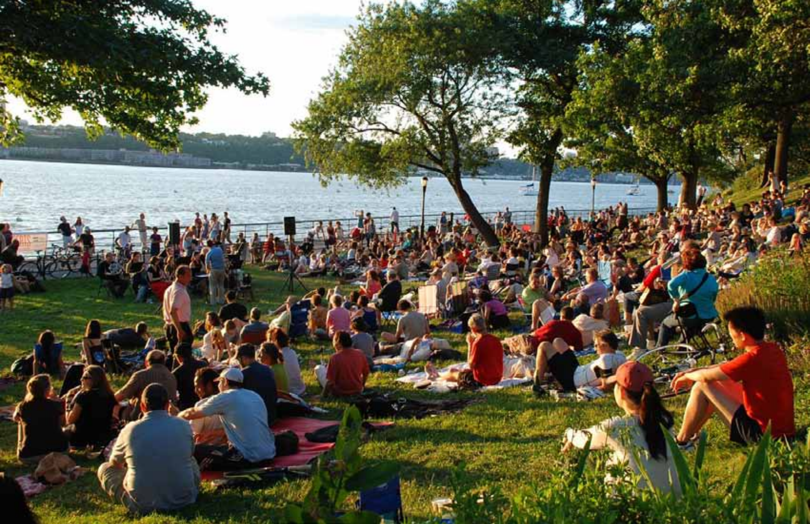
RCTA's popular summer concerts, held every Saturday at 7pm from June to August, feature everything from classical to bluegrass.